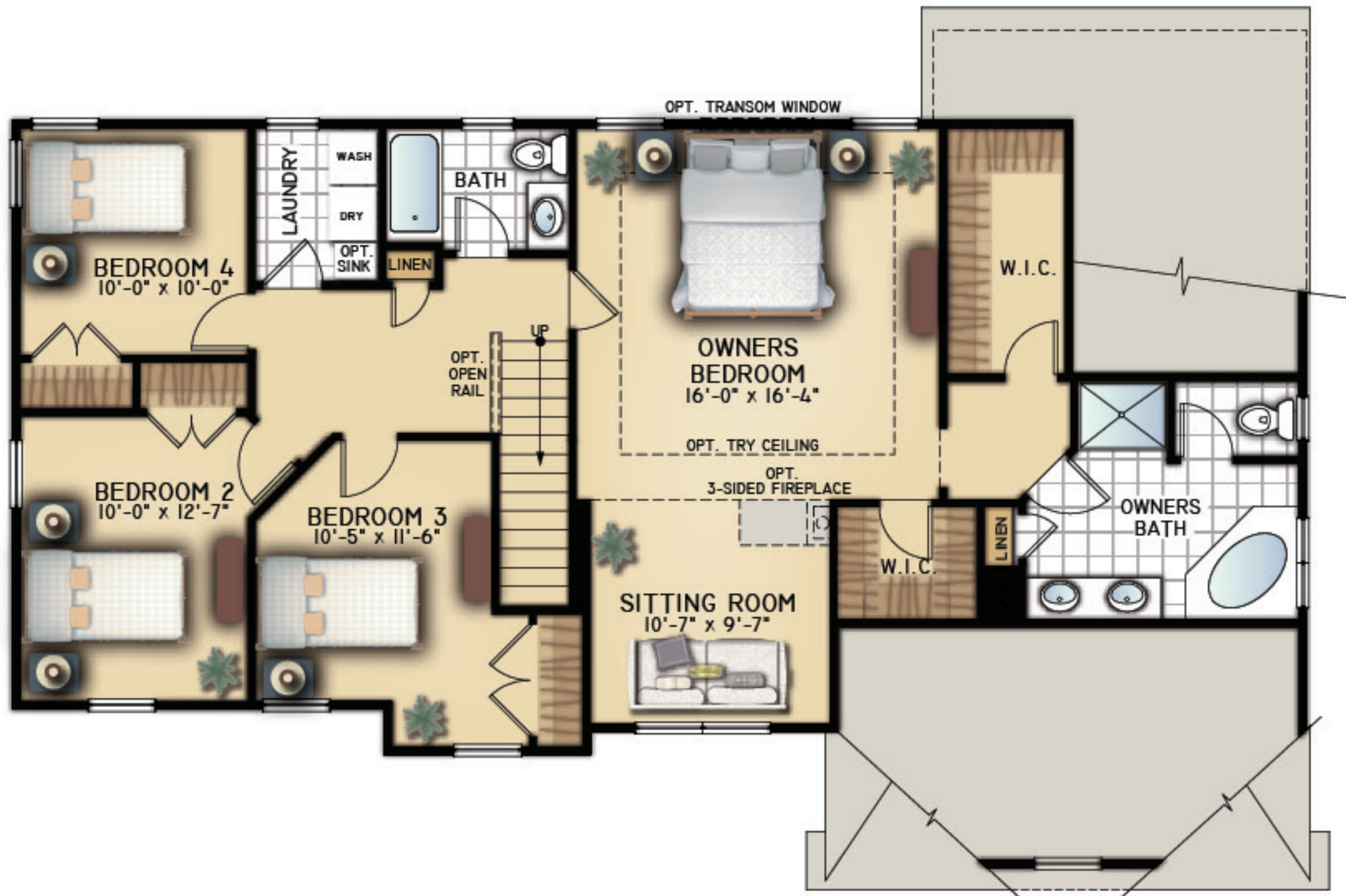
SECOND FLOOR - OPT. IN-LAW SUITE ON FIRST FLOOR